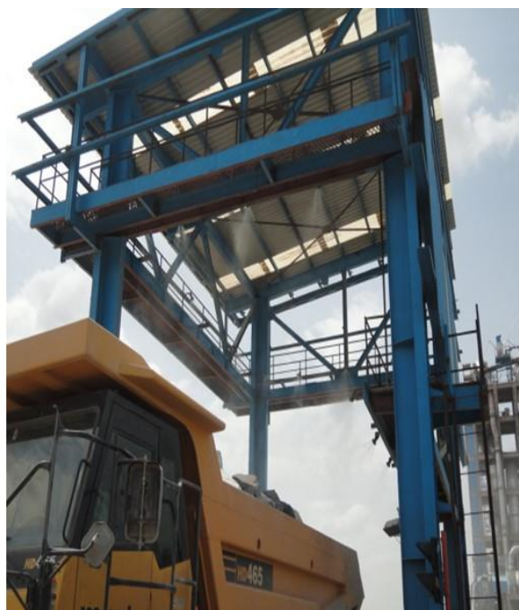
WATER SPRAYING AT CRUSHER