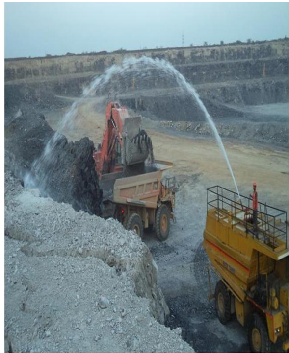
MUCK PILE WETTING