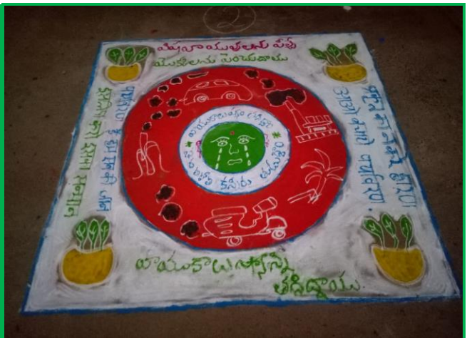
Ragoli programme on Environment protection