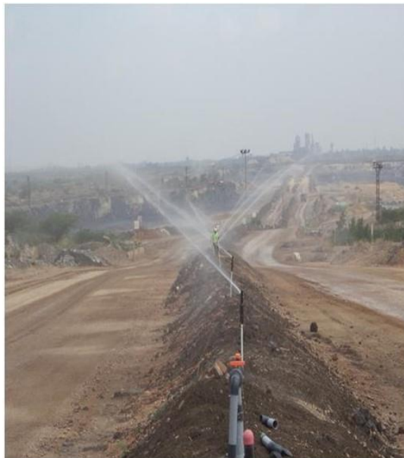
WATER SPRINKLING SYSTEM ON HAUL ROAD